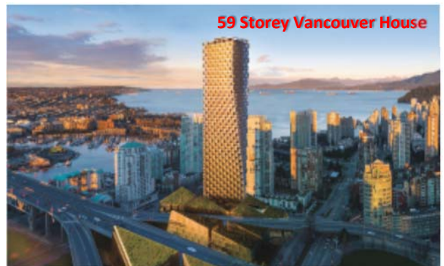
59 Storey Vancouver House