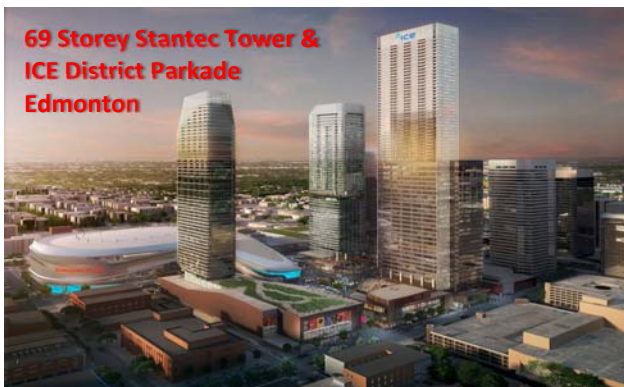
69 Storey Stantec Tower & ICE District Parkade Edmonton