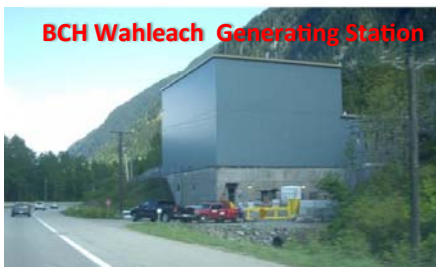
BCH Wahleach Generating Station

We are nearing completion of the BC Hydro Wahleach Generating Station fire protection system upgrade. The station is located just off the shoulder of Highway 1 past Chilliwack and is fed from Jones Lake via penstocks with the water then being discharged into the Fraser River.