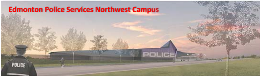
Edmonton Police Services Northwest Campus