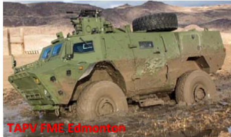
TAPV FME Edmonton

Gisborne's Alberta Fire Protection Division was awarded the contract to install Fire Protection systems in a new state of the art military facility that will house 43 Tactical Armoured Patrol Vehicles and 14 Armoured Engineer Vehicles.