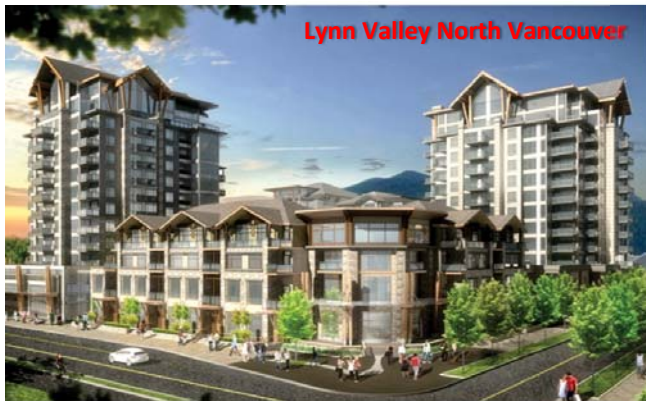
Lynn Valley North Vancouver