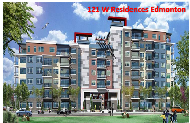
121 W Residences Edmonton

Gisborne's Alberta Fire Protection Division was awarded the contract to install Fire Protection systems in a new state of the art military facility that will house 43 Tactical Armoured Patrol Vehicles and 14 Armoured Engineer Vehicles.