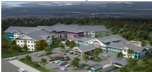
Whistlebend Care Facility Whitehorse Yukon