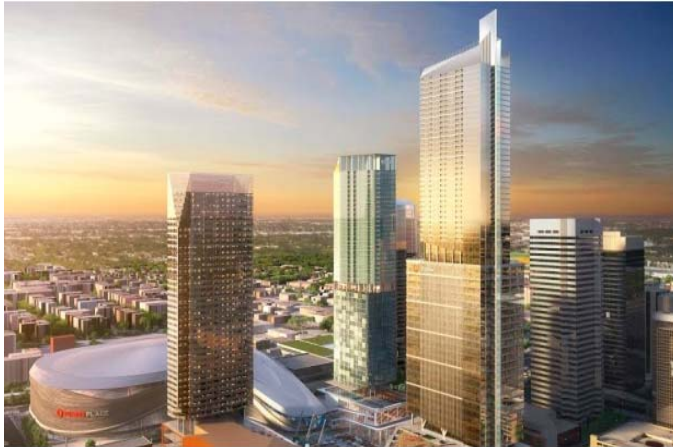
New 69 storey tower in the Ice District, adjacent to Rogers Arena