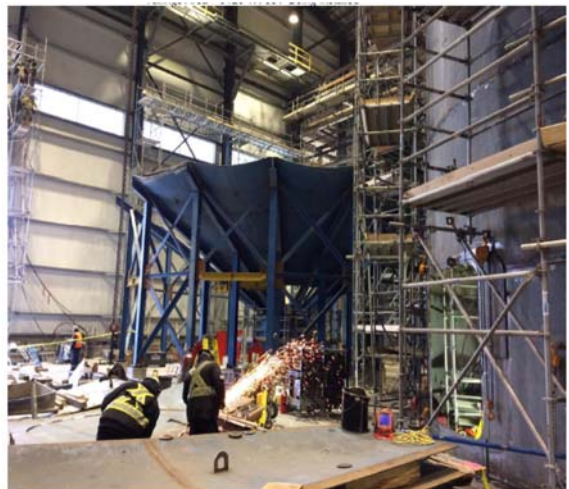
Installation of equipment in the Tailings area