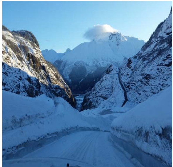
Road from Bowser to mine site—quite the drive!