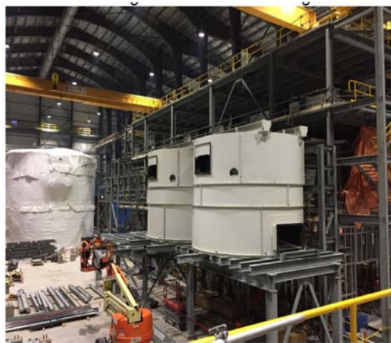
Installation of Rougher Cells in the Mill Building