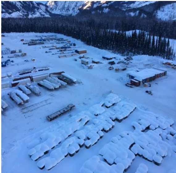
Bowser laydown area—approx 1hr drive to the mine site

CGT continues to crew up at the Brucejack Mine Construction Project in NW British Columbia. Working on a 3 and 3 schedule we expect to have over 400 Gisborne employees committed to the project as we work with the client to install all the mechanical and piping equipment required to operate the mine. While this remote location presents many unique challenges—with weather being one of the key factors—our leadership team and crews are working hard to complete the project successfully and safely.