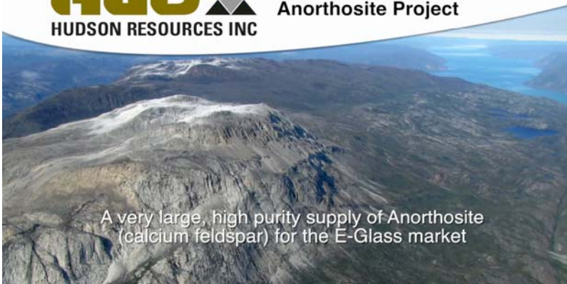
A very large, high purity supply of Anorthosite (calcium feldspar) for the E-Glass market